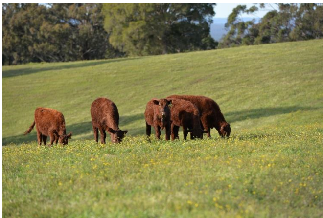
LimeRidge Devons - 10 mth. weaner steers on rye, clover

Interestingly, when you look at the various components that make up the ABCAS score, there is little variation in the results of the top exhibitors in regard to Market Specifications and Saleable Meat Yield. The MSA Eating Quality scores do vary a little more, specifically in relation to marbling. Most of the top results had quite high marbling scores, particularly the MSA marbling score – top 950; LimeRidge Devons ranged 270 to 310. The message for Devon breeders and producers – improve meat marbling!